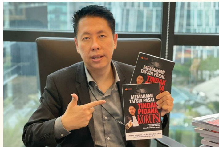
Memahami Tafsir Pasal Tindak Pidana Korupsi, Kaidah Hukum Dan Doktrin-doktrin Dalam Tindak Pidana Korupsi